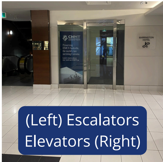
(Left) Escalators Elevators (Right)