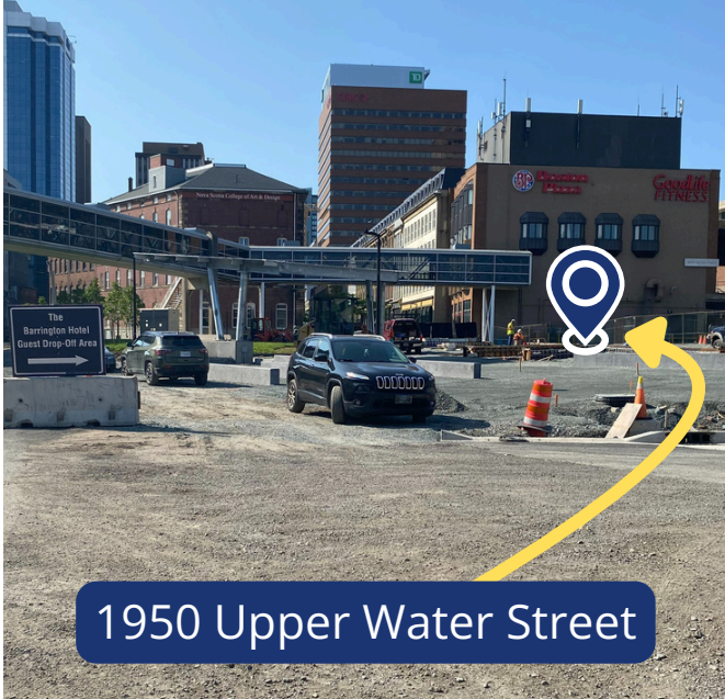
1950 Upper Water Street