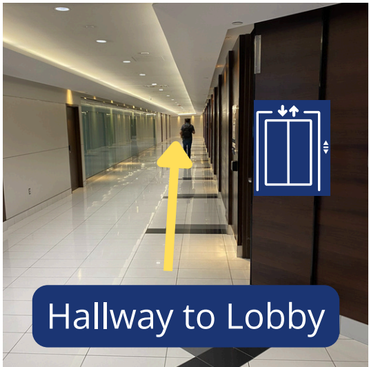
Hallway to Lobby

The nearest parkade is the Scotia Square Parkade, situated at 1901 Albemarle Street, Halifax, NS, B3J 3L9. Parking rates are calculated on an hourly basis at $4.50 per hour, with a weekday maximum of $26 plus HST (Monday to Thursday) and a reduced rate of $24 plus HST on weekends (Friday to Sunday). Guests have the option to bring their parking ticket to the front desk for validation at the same cost ($26 plus HST on weekdays or $24 plus HST on weekends), granting unlimited in-and-out privileges within a 24-hour period. Please note that ticket validation for unlimited access must be processed exclusively at the Front Desk, as the parking gates will default to charging hourly rates or the daily maximum upon each entry or exit.