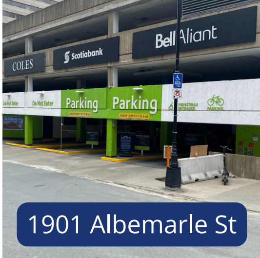
1901 Albemarle St