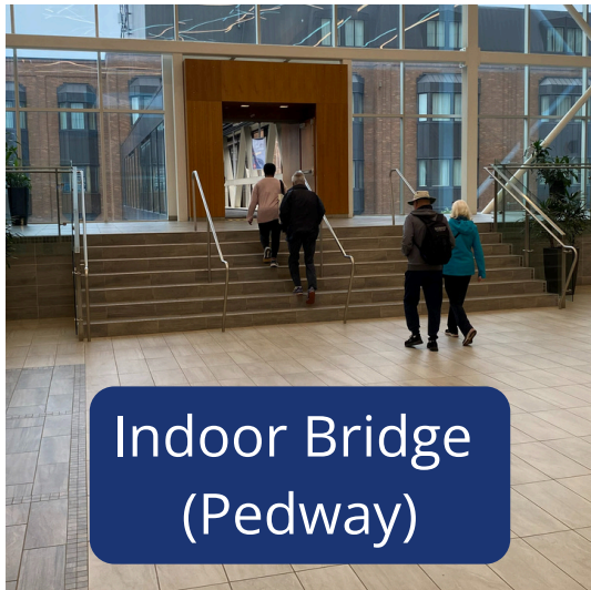
Indoor Bridge (Pedway)