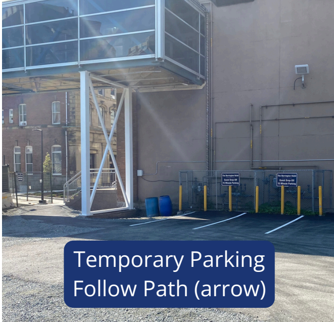
Temporary Parking Follow Path (arrow)