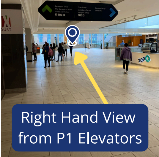
Right Hand View from P1 Elevators