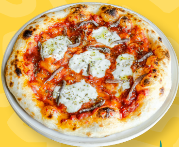
17. Romana 390 THB / 290 THB tomato sauce, burrata, anchovies, oregano and olive oil