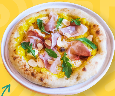
16. Zucca & Speck Pizza 440 THB / 350 THB 🐱 pumpkin cream, mascarpone, speck ham and balsamic reduction

All pizzas are available in small and regular sizes