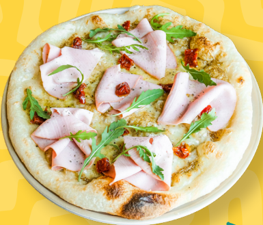
18. Pistachio Pesto & Mortadella Pizza 440 THB / 340 THB 🍷 🐱 pistachio pesto, mozzarella, Parmesan, mortadella, sun-dried tomatoes and rocket salad