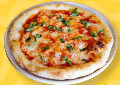
22. Margherita Pizza 380 THB / 270 THB 🌱 freshly made tomato sauce, mozzarella and basil leaves