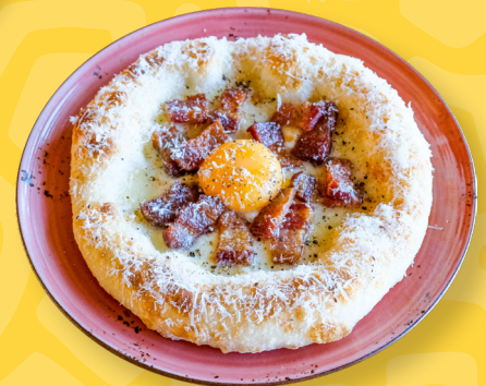
23. Carbonara on Focaccia 290 THB 🐱 freshly baked focaccia dough with Parmesan, pancetta and egg yolk