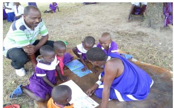
Children reading new books provided by Selous Serena Camp.

There is a Maasai village located around 13km from SSC . Some time ago, the community saw the need for a school, which they built at their own expense. When staff of SSC visited the school, they noticed the lack of basic classroom items such as books, chalk, exercise books, and rulers as well as trees to provide shade around the school. SSC thus decided to support the school by providing them with books, trees for shade, and prizes for those who perform well on examinations. SSC is advancing the Reading for Children program at the school and it looks forward to continuing to build the relationship with the community in the future.