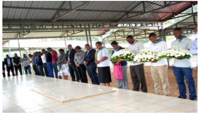
Kigali Serena Hotel staff pays tribute to victims at the Nyanza Memorial Centre.