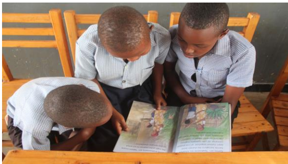
Boys reading the book 'Life History of a Butterfly'