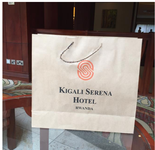
Reusable and recyclable paper bag from Kigali Serena Hotel, which is personalized and used at all Serena Hotels' properties.

On August 28 th , 2017 the Government of Kenya took a bold stand for conservation by passing a law which bans the use, manufacture, and import of plastic bags. Plastic bags included within the ban are grocery bags, supermarket bags, and duty-free bags. This new law aims at eliminating plastic bag pollution which contributes significantly to reduce environmental degradation, ocean pollution, and animal deaths. They are also a hazard to agricultural land and pollute tourist areas. Plastic bags can take several hundred years to decompose and pose a great risk to conservation. Kenya joins several other African countries, such as Rwanda, who have already banned plastic bags. United Nations Environment Programme estimates that before the ban, around 100 million plastic bags were used in Kenya each year – a number which should be reduced significantly with this new ban. Serena Hotels commends this important step taken to protect the environment as this initiative complements its waste management program.