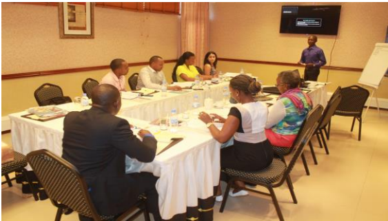
Education facilitators receive training.