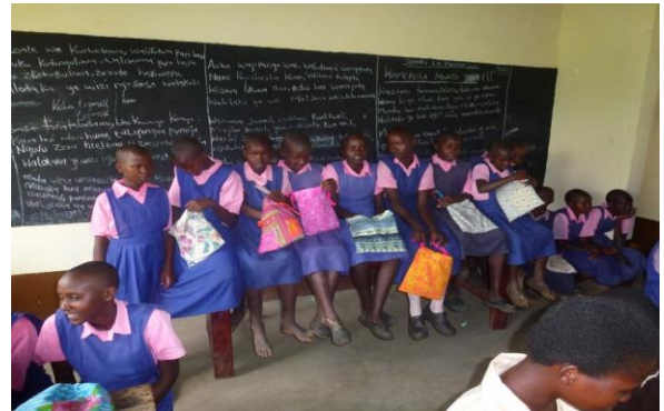
Girls receiving sanitary kits at Mwitasyaano Schools.

Kilaguni Serena Safari Lodge partnered with Upendo Women’s Foundation and Kisima Safaris to donate 250 sets of re-usable sanitary kits for girls at Mwitasyaano Primary and Secondary schools. The girls were trained on proper usage of the kits, which can last up to 4 years. The schools are located in a community heavily dependent on small-scale farming which has been affected by this year’s drought. Therefore, this donation has provided the school girls with necessary sanitation during a difficult time.