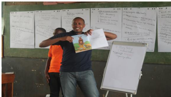
Community members receiving training on language development and storytelling.