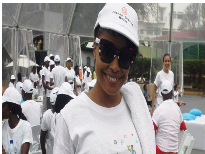
Famous Mozambican singer, Neyma, participates in Polana Serena Hotel Health Fair.