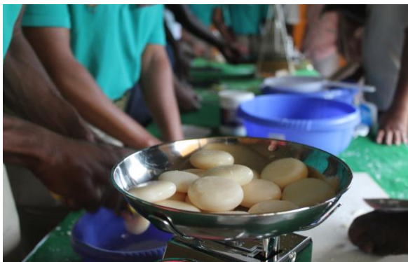
Making soap at Lake Elmenteita Serena Camp.