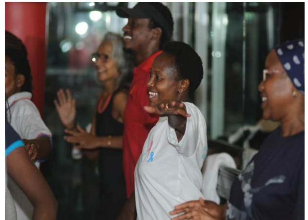
Participants enjoying a Zumba class while exploring the benefits of exercise at the Nairobi Serena Hotel.