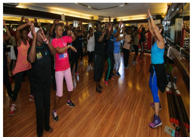
A lively Zumba class at Nairobi Serena Hotel during the World Cancer Day.

“Let us be good stewards of the Earth we inherited. All of us have to share the Earth’s fragile ecosystems and precious resources, and each of us has a role to play in preserving them. If we are to go on living together on this earth, we must all be responsible for it.”