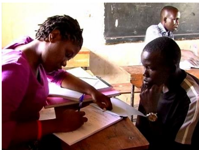
Registration for testing at LVSGR&S.