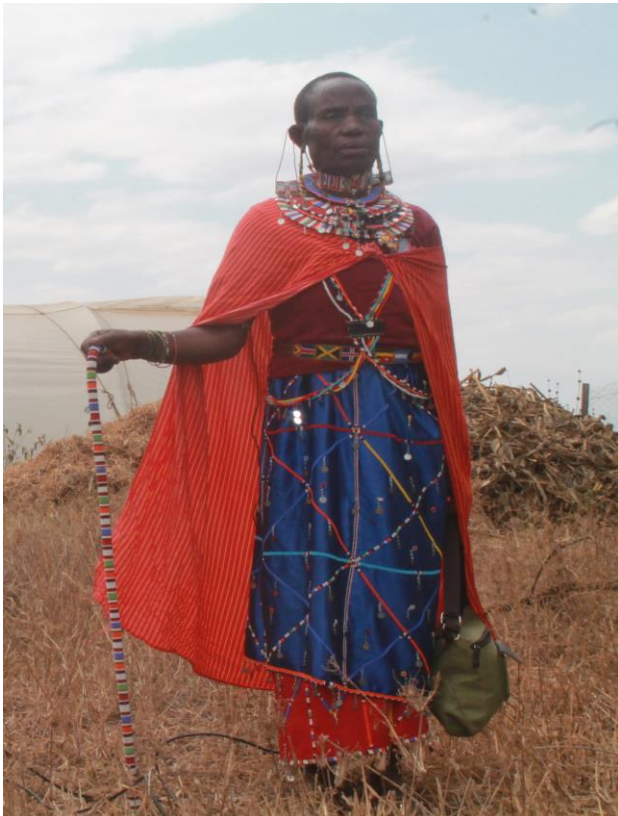
A proud member of the Kimana's Women's Group that is supported by Amboseli Serena Safari Lodge.

From 2014 to 2017, Amboseli Serena Safari Lodge has partnered with the International Labour Organization (ILO), Tech for Trade, and the African Pro-Poor Tourism Development Centre to provide opportunity to the Kimana Women's Group in Amboseli. The Kimana Women's Group is a self-started group for HIV-affected women who originally came together to form a business and raise awareness on HIV/AIDS within the community. In line with the UNDP SDGs on gender equality (SDG 5), decent work and economic growth (SDG 8), responsible consumption and production (SDG 12), and partnerships for the goals (SDG 17), the partnership has supported the women's group in developing their business which now provides high-quality fresh produce to ASSL and other businesses in the area. This initiative has had a significant impact on the livelihoods of the women and their families - the average family size for the women is 5 per household hence the partnership regularly benefits around 250 individuals directly. By supporting a responsible supply chain, ASSL was also able to reduce its carbon footprint by buying locally sourced produce. The hotel hopes to build on this partnership in the future, as it continues to be committed to responsible and sustainable economic development.