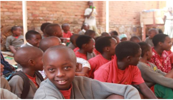
Children participating in Reading For Children activities.