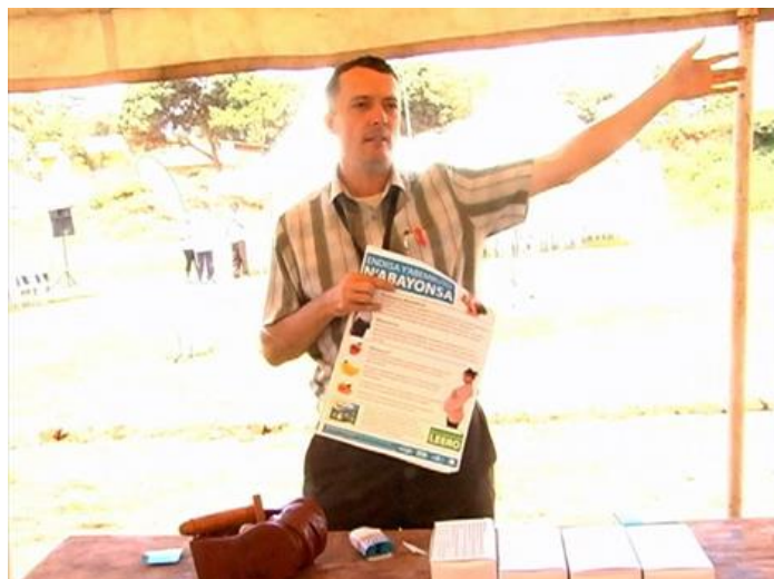
Health talk on the use of condoms and family planning at LVSGR&S.

In August 2017, Lake Victoria Serena Golf Resort & Spa partnered with International Medical Link, Uganda Batti, and Uganda Manufacturers Association to host a community health camp in Kitiko, Uganda (aligns with SDG 3 on good health and well-being). During this event, several health services were extended to the community, including HIV/AIDS counselling and testing, safe male circumcision, and deworming for children aged 10 and below. Household utensils and health products were distributed to members of the community. The success of the event was further enhanced by the contribution of USAID's global health initiative which provided technical support and medical supplies such as testing kits.