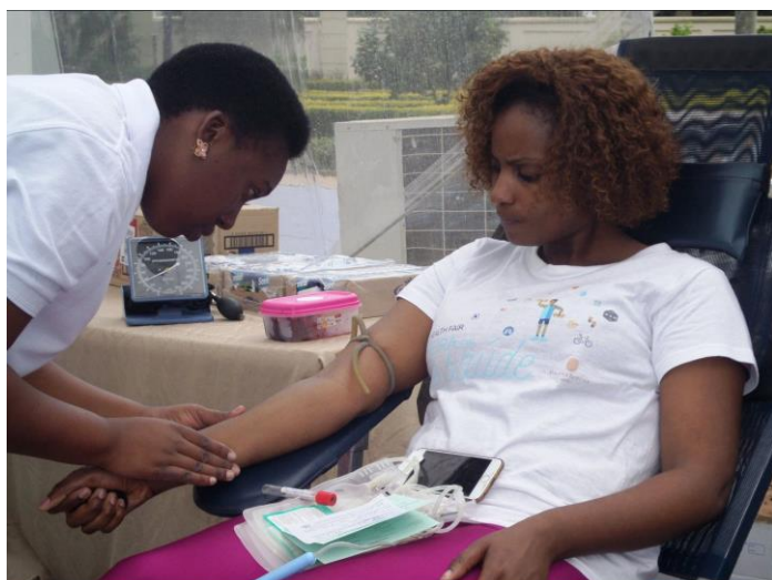
Participant donating blood to the Central Hospital during the Polana Serena Hotel Health Fair.