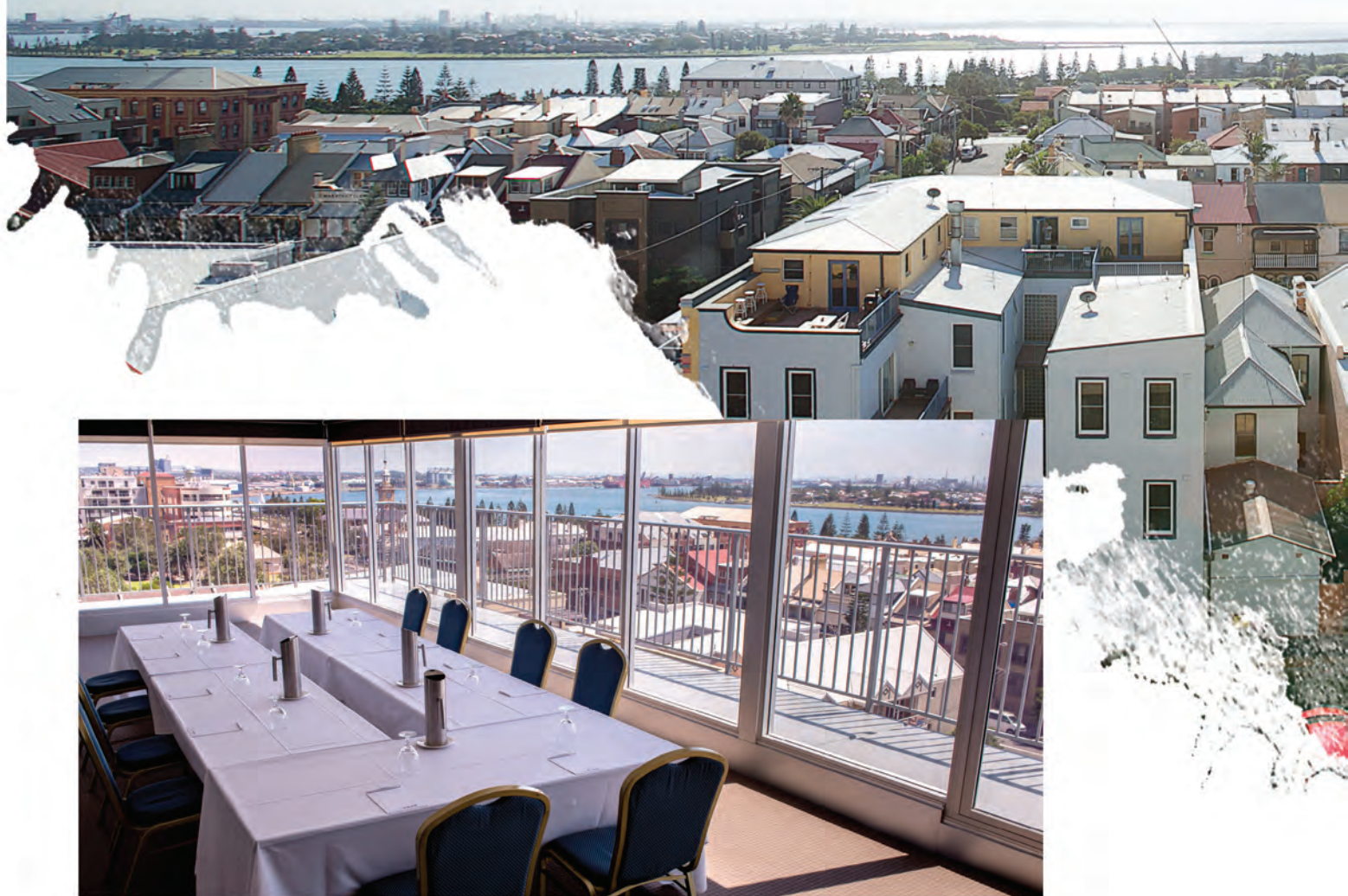
The inspirational view from Harbour View room