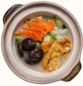
vegan claypot tofu