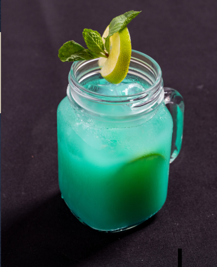
blue hawaiian pineapple, lime, lemon and blue curacao.