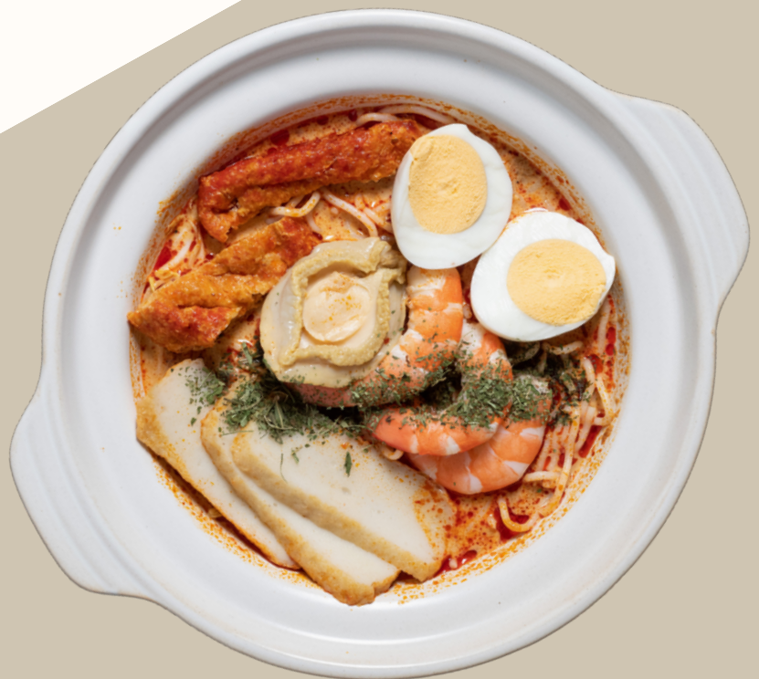
claypot abalone laksa