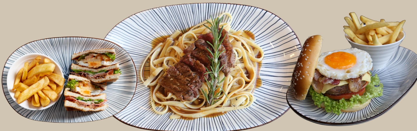
focaccia club sandwich