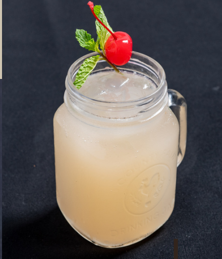
gunner ginger ale, ginger beer and angostura bitters