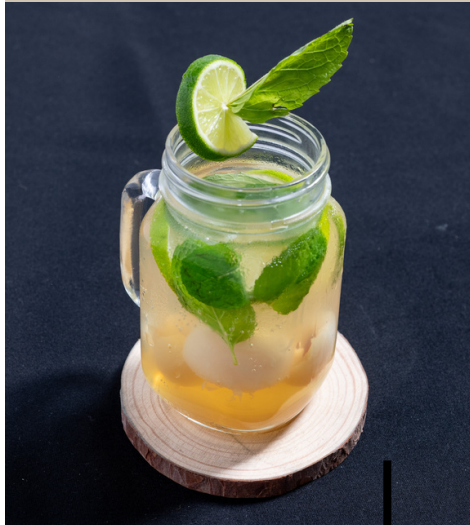
lychee mojito lychee, lime, mint, brown sugar and soda water.