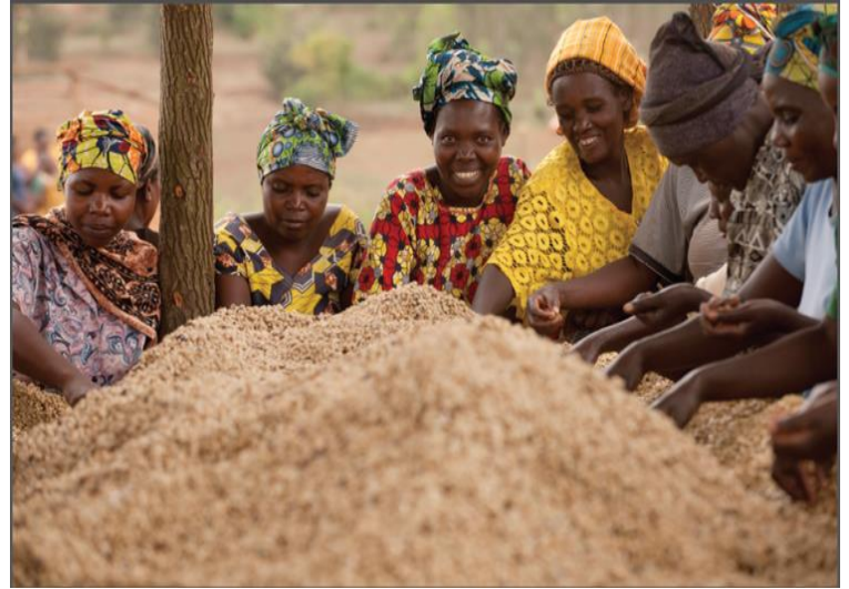
Rwandan women coffee farmers supported through Serena Hotels Rwanda partnership with Sustainable Growers.

Guests are given the opportunity to experience coffee farm tours and master classes offered by Sustainable Growers.