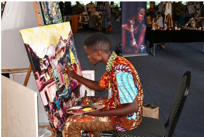
Farmers' and Artisans' Market at Kigali Serena Hotel.

Aligning with SDG 8: Decent Work and Economic Growth