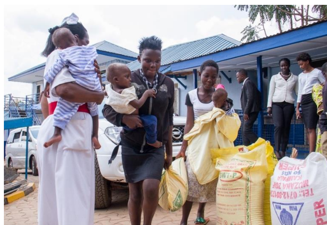
Donations made by Serena Hotels Uganda to the Mwanamugimu Malnutrition Unit.