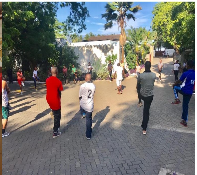
Staff wellness activities at Serena Beach Resort and Spa.

"It is one of the most beautiful conceptions of life that no man can sincerely try to help another without helping himself." – Ralph Waldo Emerson, American poet.