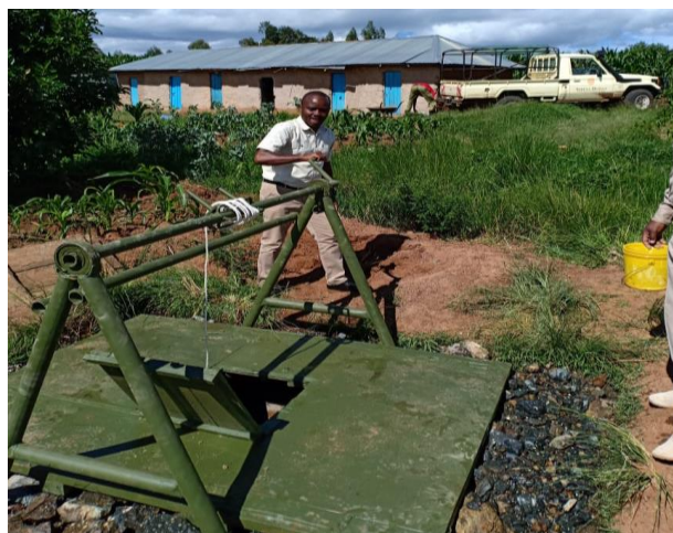
26-foot well at Isokon Primary School, near MSSL.

Amboseli Serena Safari Lodge (ASSL) provides safe, clean drinking water to approximately 4,800 members of the community and 30,000 of their livestock per annum.