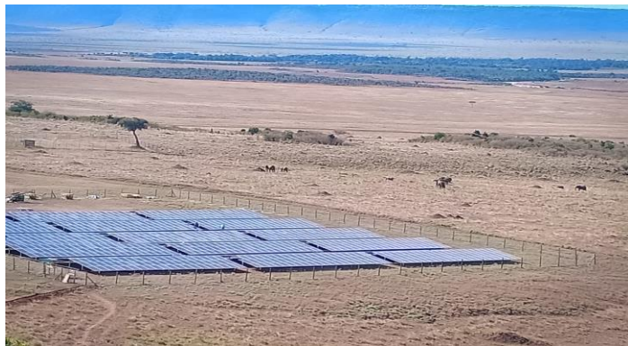
Solar Power Plant at Mara Serena Safari Lodge.

Wherever possible, management are committed to replicating the Solar Power Plant model at the other Serena properties in Africa. A tour to the Solar Power Plant has become a popular and intriguing guest activity. The Solar Power Plant aligns with SDG 7: Affordable and Clean Energy; SDG 12: Responsible Consumption and Production; SDG 13: Climate Action; and SDG 15: Life on Land.