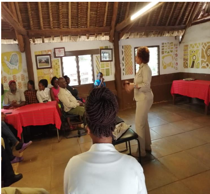
Mental health talk at Kilaguni Serena Safari Lodge.

Amboseli Serena Safari Lodge (ASSL) provided 64 members of the Oldule Village with treatment for minor illnesses via an outreach exercise. The ASSL clinic provides free medical outreach to 1,920 members of the community per annum. Kilaguni Serena Safari Lodge (KSSL) commemorated World Wellness Day by engaging staff and community members in a talk about mental health. Following this, KSSL staff and community members participated in a football match.