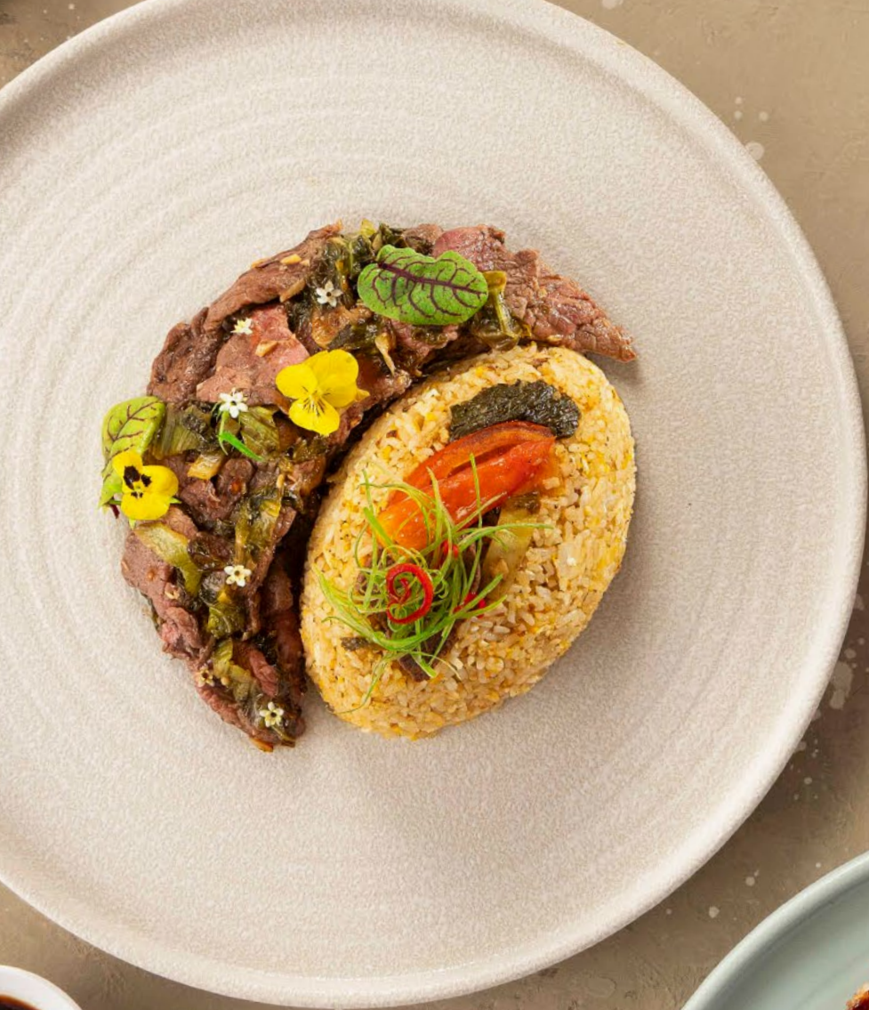
131. HANOI BEEF FRIED RICE WITH PICKLES 🍴 🐮