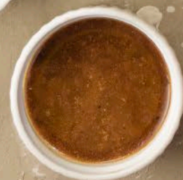
Black Peppercorn Sauce