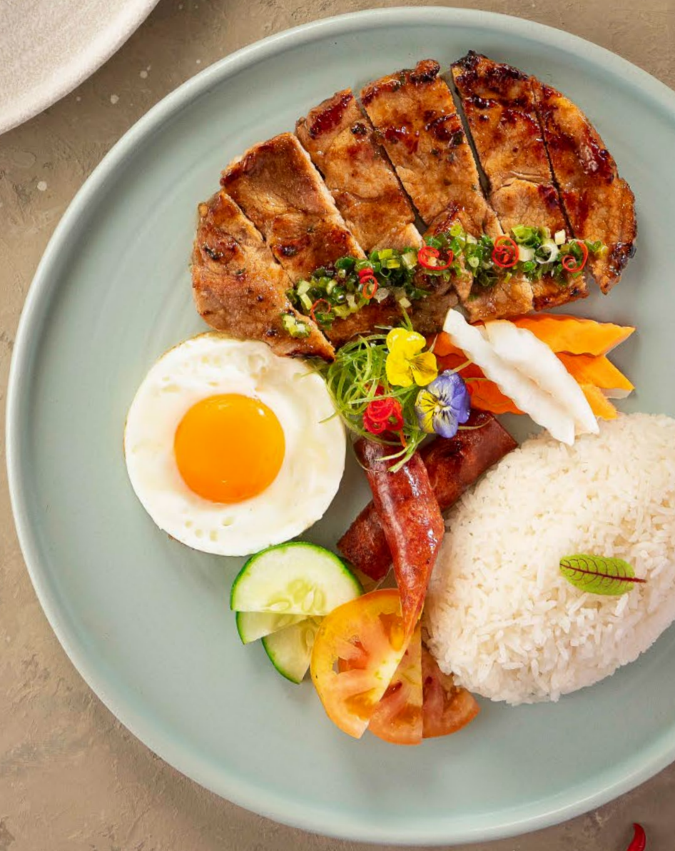
132. SAIGON HERITAGE COM TAM 🍴 🐷

Vietnamese broken rice featuring caramelized pork, Chinese sausage, a crispy fried egg, and pickled vegetables.