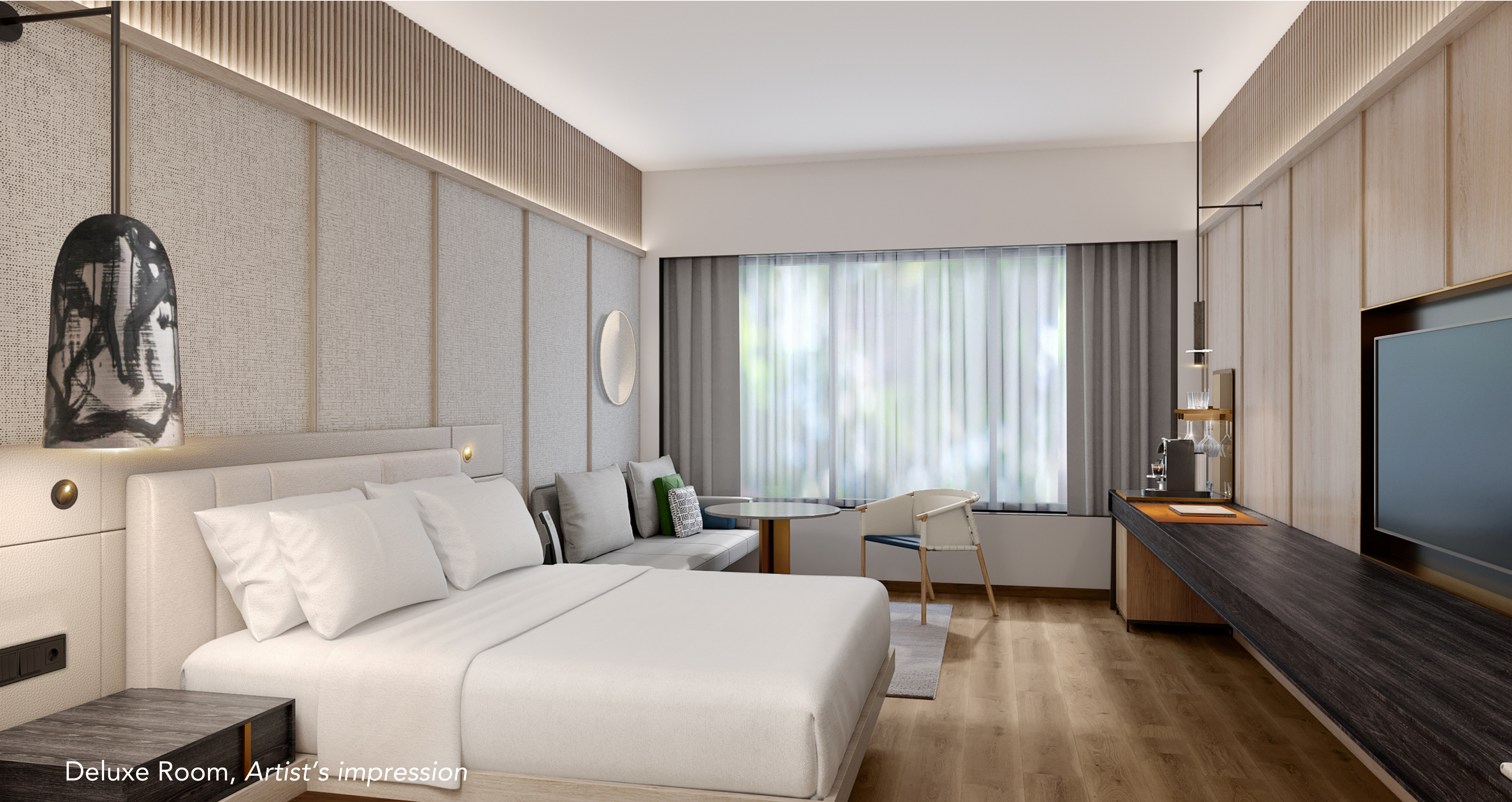
Deluxe Room, Artist's impression