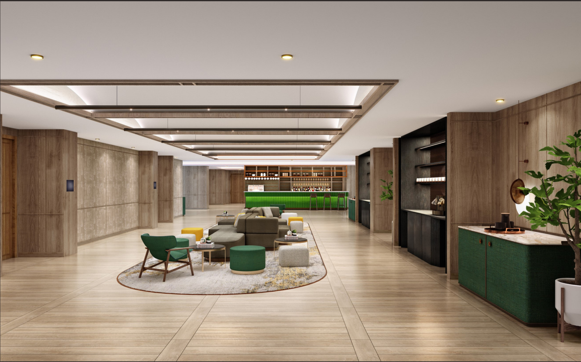
Foyer, Artist's impression