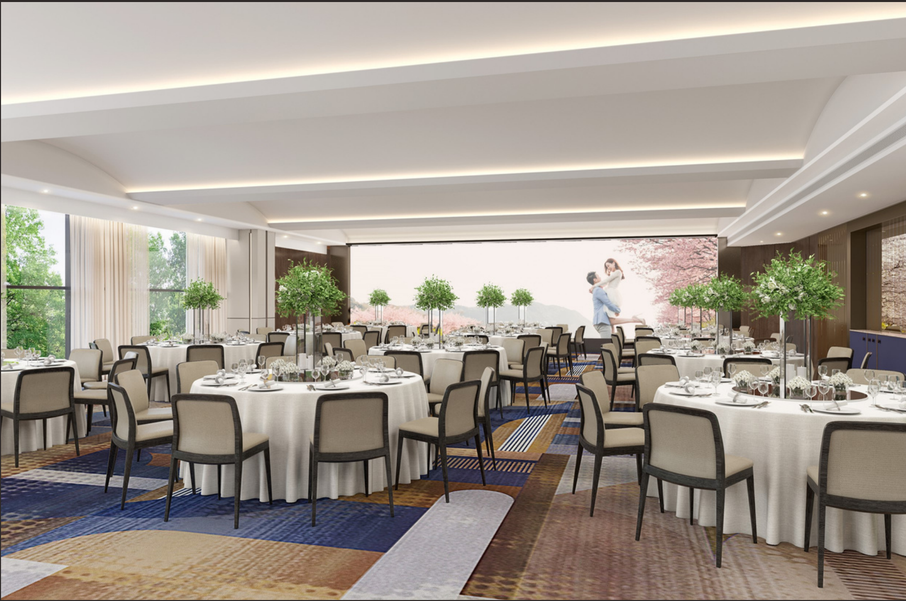
Grand Ballroom, Artist's impression