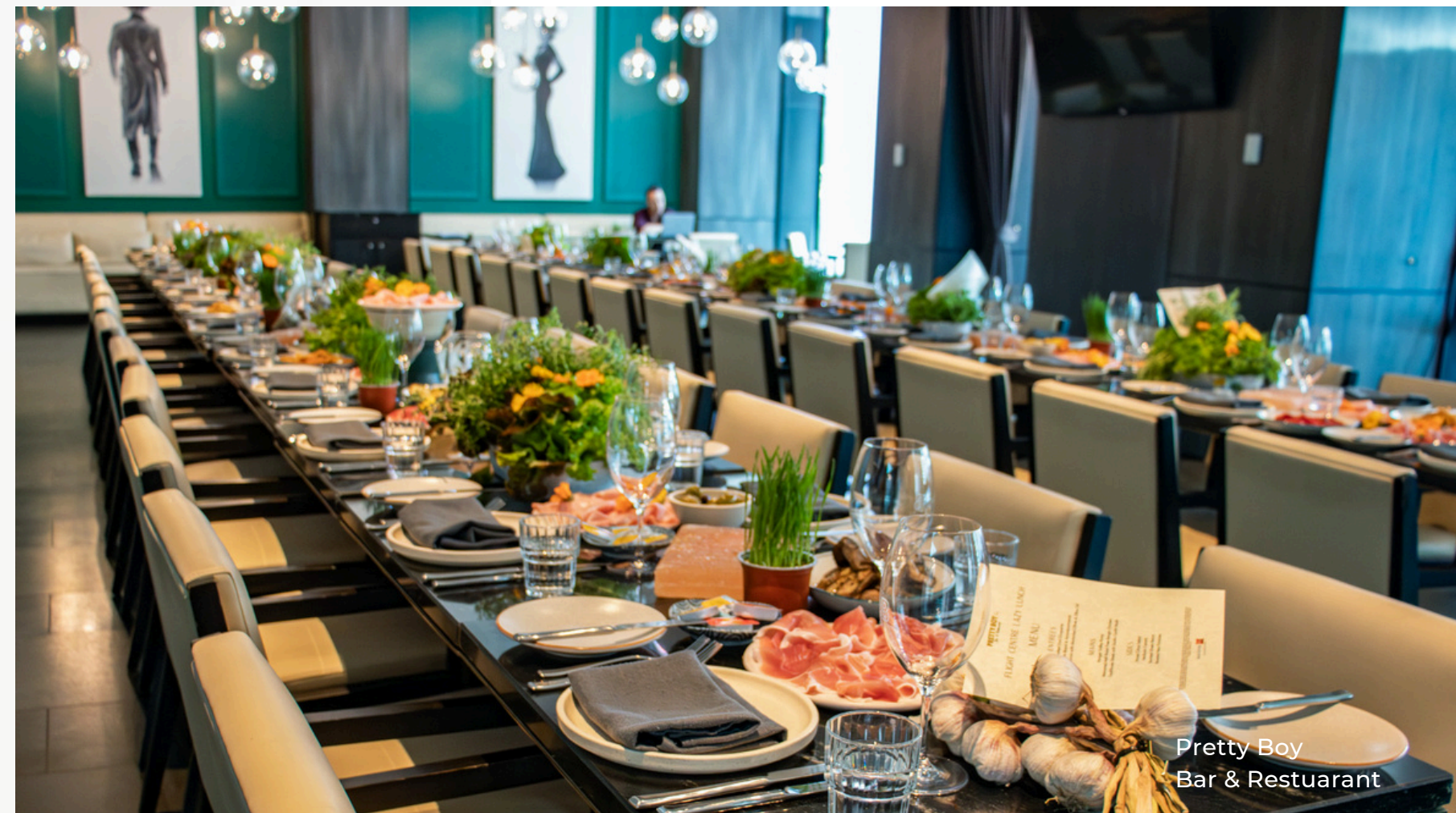
Pretty Boy Bar & Restaurant

The atmosphere balances energy and elegance, creating a setting that transitions seamlessly from business dining to evening celebrations.