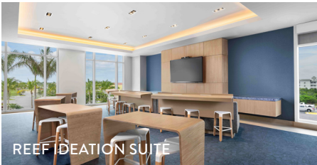
REEF IDEATION SUITE