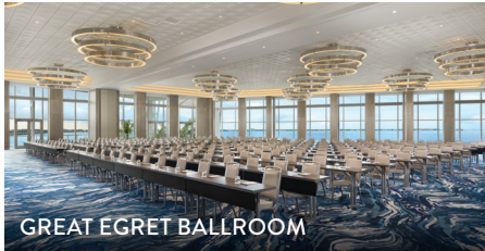
GREAT EGRET BALLROOM