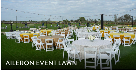
AILERON EVENT LAWN

For additional information or to inquire about hosting your next event at Sunseeker Resort Charlotte Harbor, reach out to sales@sunseekerresorts.com