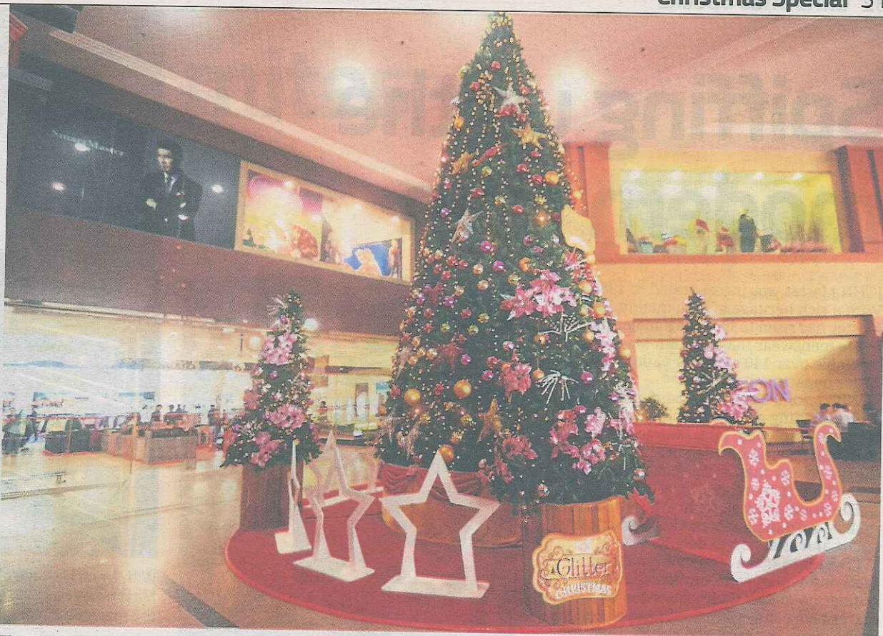
The Christmas cheer awaiting shoppers inside IOI Mall Puchong.