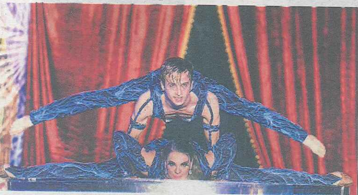
Shoppers can head over to the big top for an evening of live performances after shopping.

WITH the Yuletide season just around the corner, IOI Mall Puchong will be livening up the festive mood with a fantastic circus to entertain its customers, young and old alike.