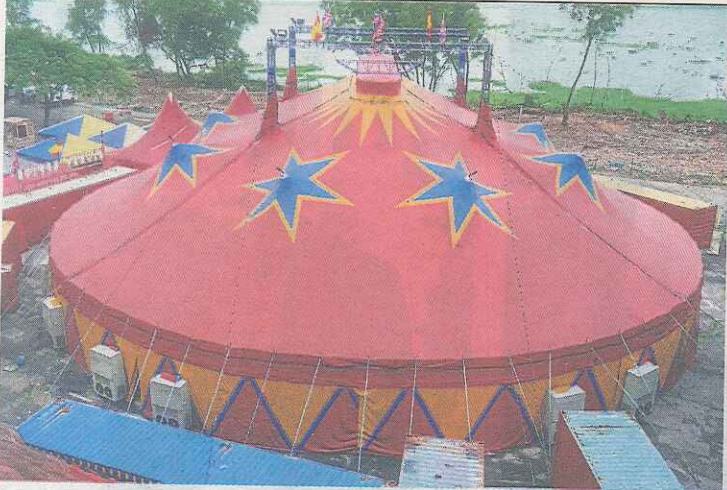
An impressive marquee tent large enough to seat a crowd of 800 will be set up outside IOI Mall's outdoor parking area.