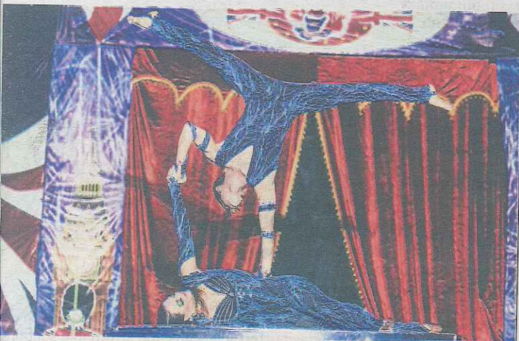
Flexible gymnastic performances.

■ For more information, contact 03-5882 8888.