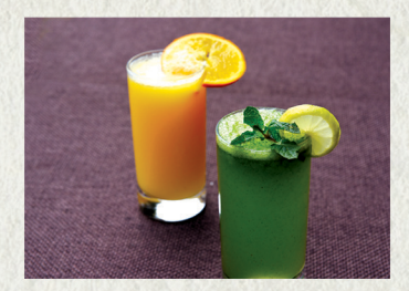
Specialties From our Barista

Throughout the day, we are offering a selection of refreshing & flavourful beverages, which includes: