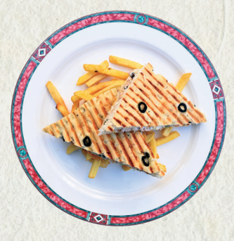
All Prices Are Subject to Applicable Taxes

Eggplant, champignon, zucchini, capsicum, pesto