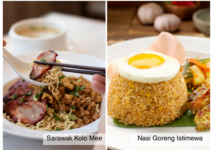
Sarawak Kolo Mee

To learn more or to make a reservation, please visit https://tinyurl.com/56ejawx3