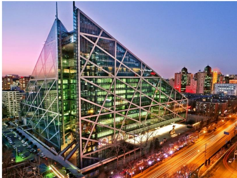
Hotel Éclat Beijing Exterior

Beijing, June 27 th , 2023 – Hotel Éclat Beijing, a renowned luxury boutique hotel, is excited to announce the launch of its latest innovation in guest services – Velma, the AI Hotel Chatbot, paving the way for a new era of digitalization. Developed in collaboration with Quicktext, the world-leading French company specializing in artificial intelligence and big data solutions for the hospitality industry, this groundbreaking artificial intelligence solution harnesses the power of big data to elevate guest experiences and spearhead Hotel Éclat Beijing's digitalization development.