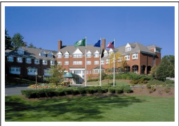
The Simsbury Inn