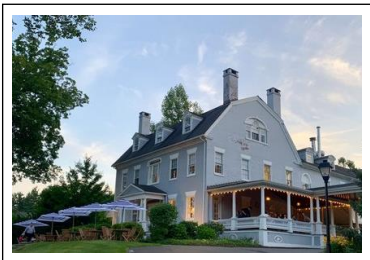
Simsbury 1820 House