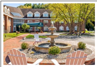
Avon Old Farms Hotel