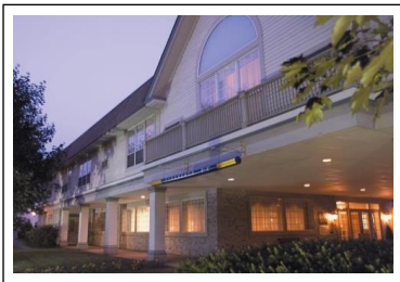
Farmington Inn & Suites

Unchain yourself from the ordinary. Discover an original!