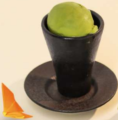
抹茶アイス Matcha Ice Cream