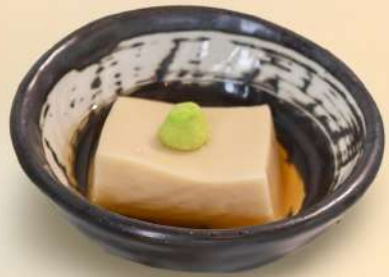
季節の小鉢 Seasonal appetizer