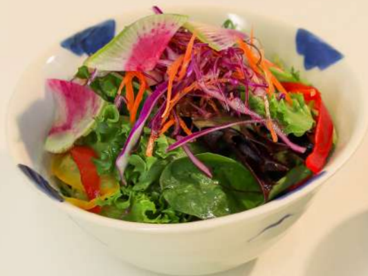
生野菜サラダ和風ドレッシング Fresh mixed vegetable salad