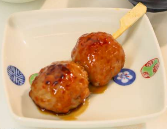
炉端鶏つくね串 Robata chicken spheres in teriyaki sauce