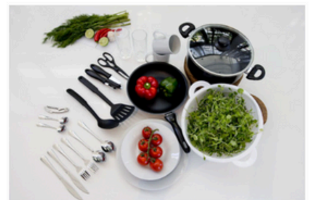
Kitchen and Dining Essentials $156.20