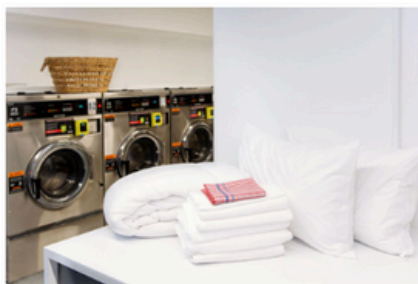
Bed and Bath Essentials $222.20 - $261.14