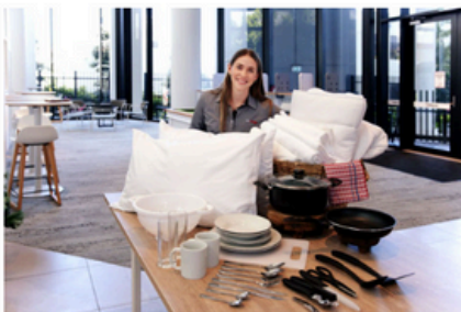
All-in-one-Essentials $367.40 - $406.34