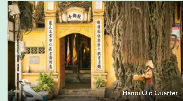
Hanoi Old Quarter