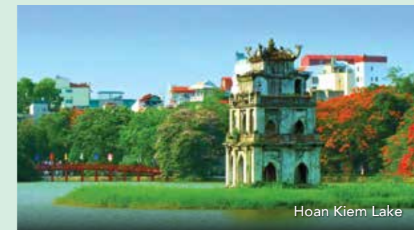
Hoan Kiem Lake