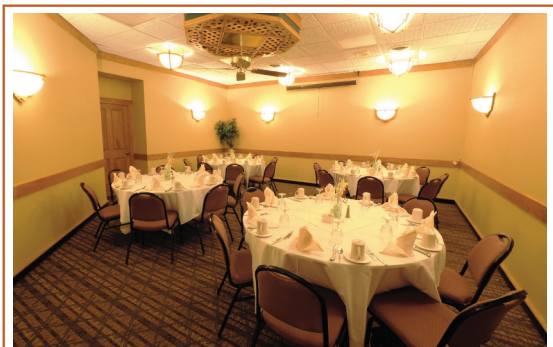
The Golf Room configured with Rounds of 8, ideal for small meetings, or break-out sessions