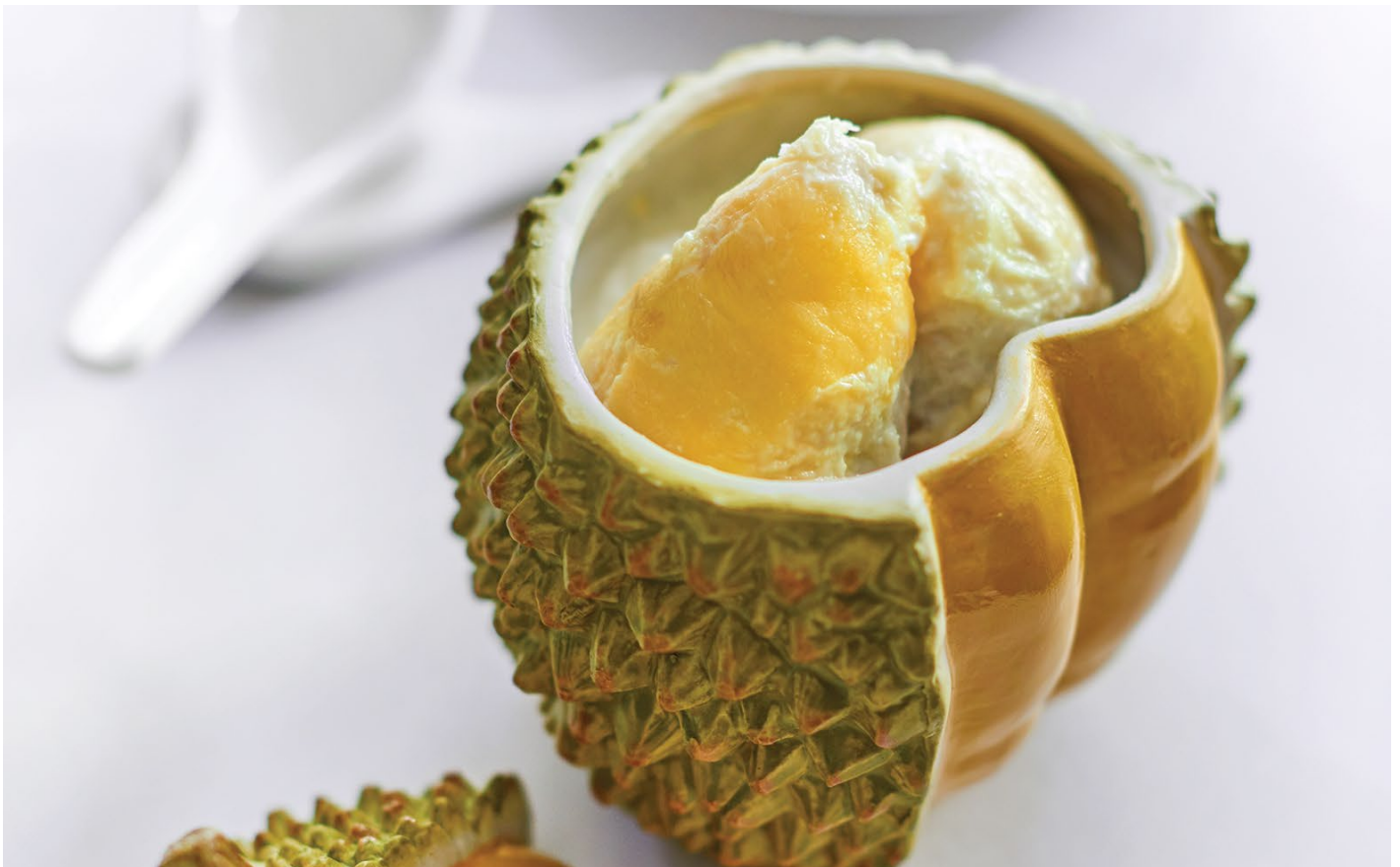
Bibik Santan D24 Durian Dessert $18 An Indulgence Rediscovered from a Traditional Peranakan Recipe