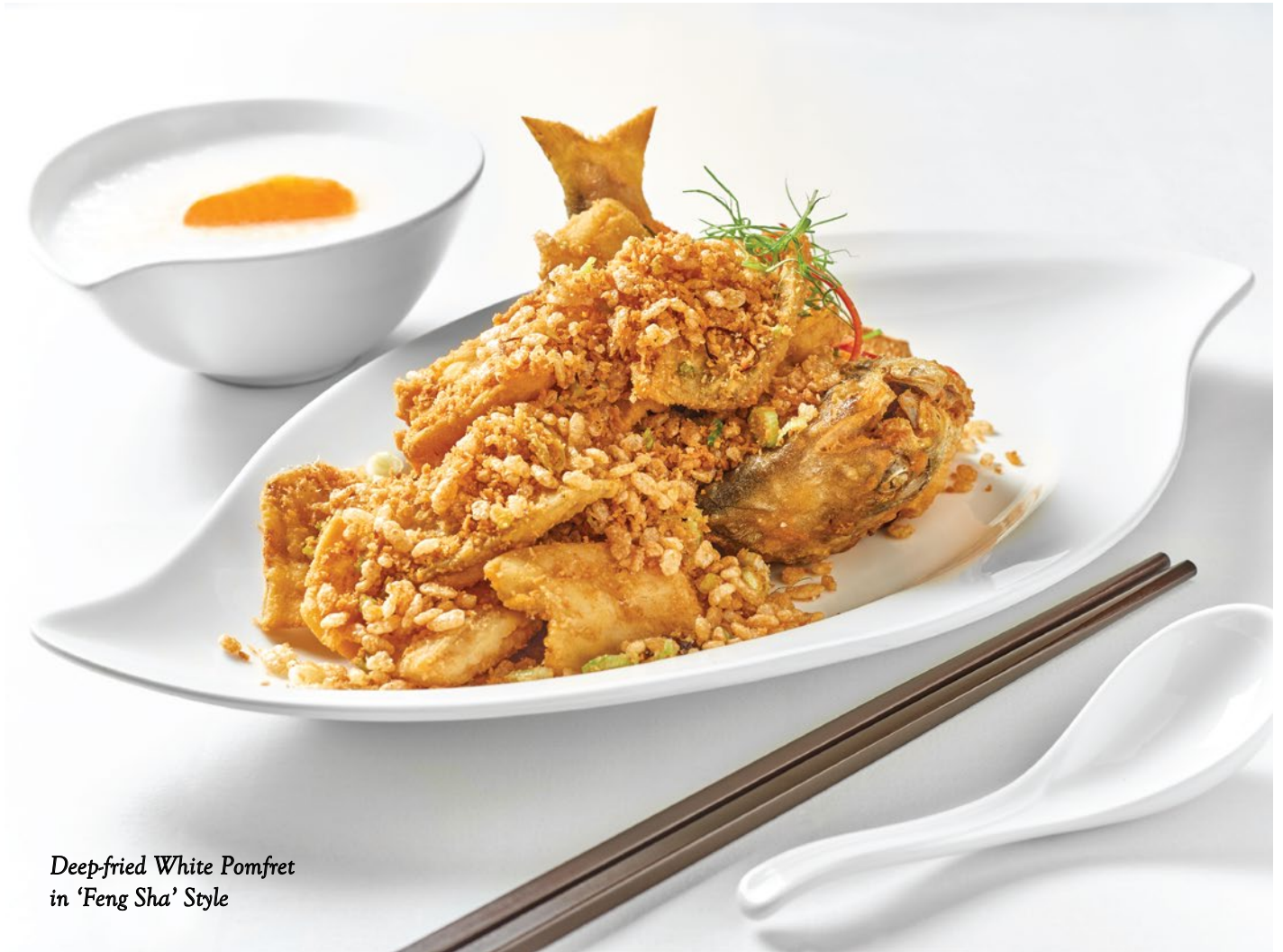
Deep-fried White Pomfret in 'Feng Sha' Style