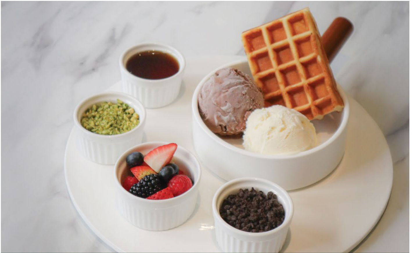
Ice Cream and Crisp Waffle with Drizzles and Sprinkles $19 Featuring Crushed Pistachios, Oreo Cookie Crumbs, Assorted Berries and Maple Syrup