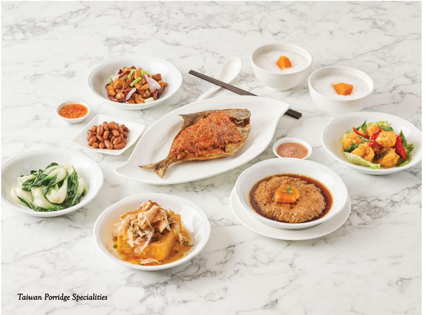
Taiwan Porridge Specialities