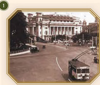
The Fullerton Building - "A Monument Worthy of the City"

Built in 1928, this was a government building named after the first governor of the Straits Settlements, Robert Fullerton. It was situated at the mouth of Singapore River at the site of the former Fort Fullerton (1825-1873), the first line of defence for Singapore.