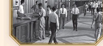
General Post Office (GPO)

Head over to Fullerton Road to view the building's most prominent East façade, designed to face the harbour and make a strong impression on travellers arriving in Singapore in the early days.