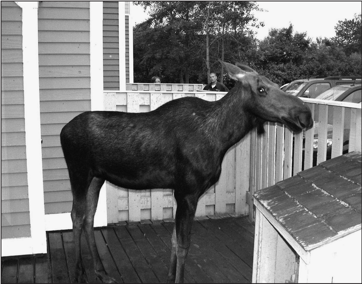
MOOSE WAITING TO CHECK INTO #49, BLUEFIN BAY