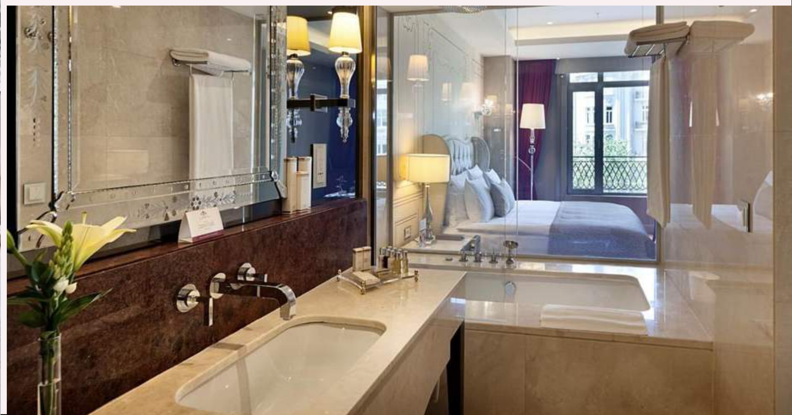
DAILY USE ROOM